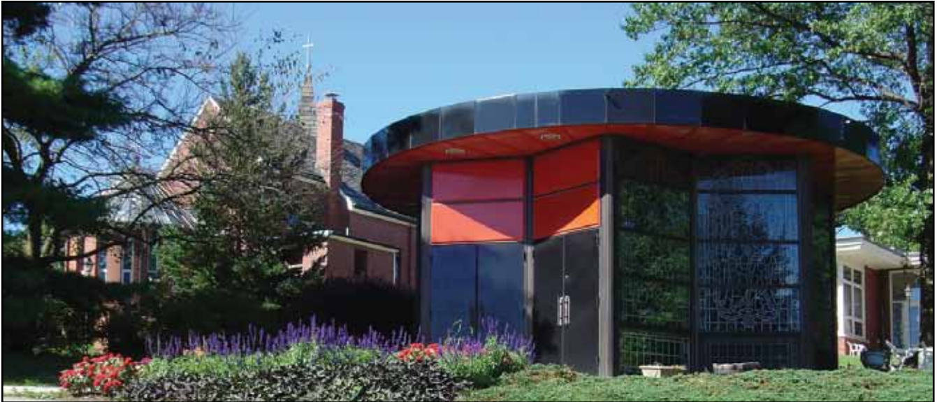
Shrine of St. Walburga located at St. Emma Monastery

Built in 1974, the walls of this star-shaped chapel were originally the 12 stained glass windows designed for the former St. Walburga Church in Pittsburgh, PA. The windows depict the life of St. Walburga, a Benedictine nun who was born in Anglo-Saxon England in 710 and followed her kinsman, St. Boniface, in the German mission.