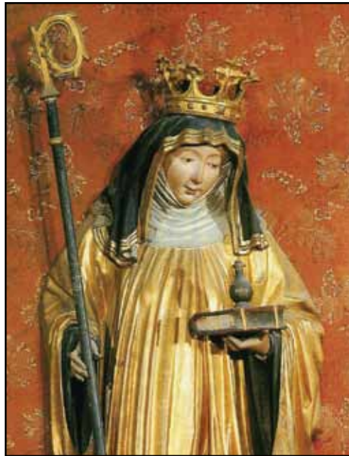
St. Walburga statue (15th century) in Abtei St. Walburg